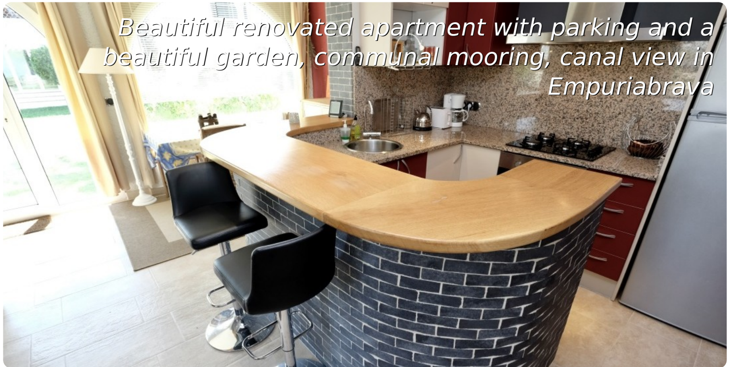
Beautiful renovated apartment with parking and a beautiful garden, communal mooring, canal view in Empuriabrava