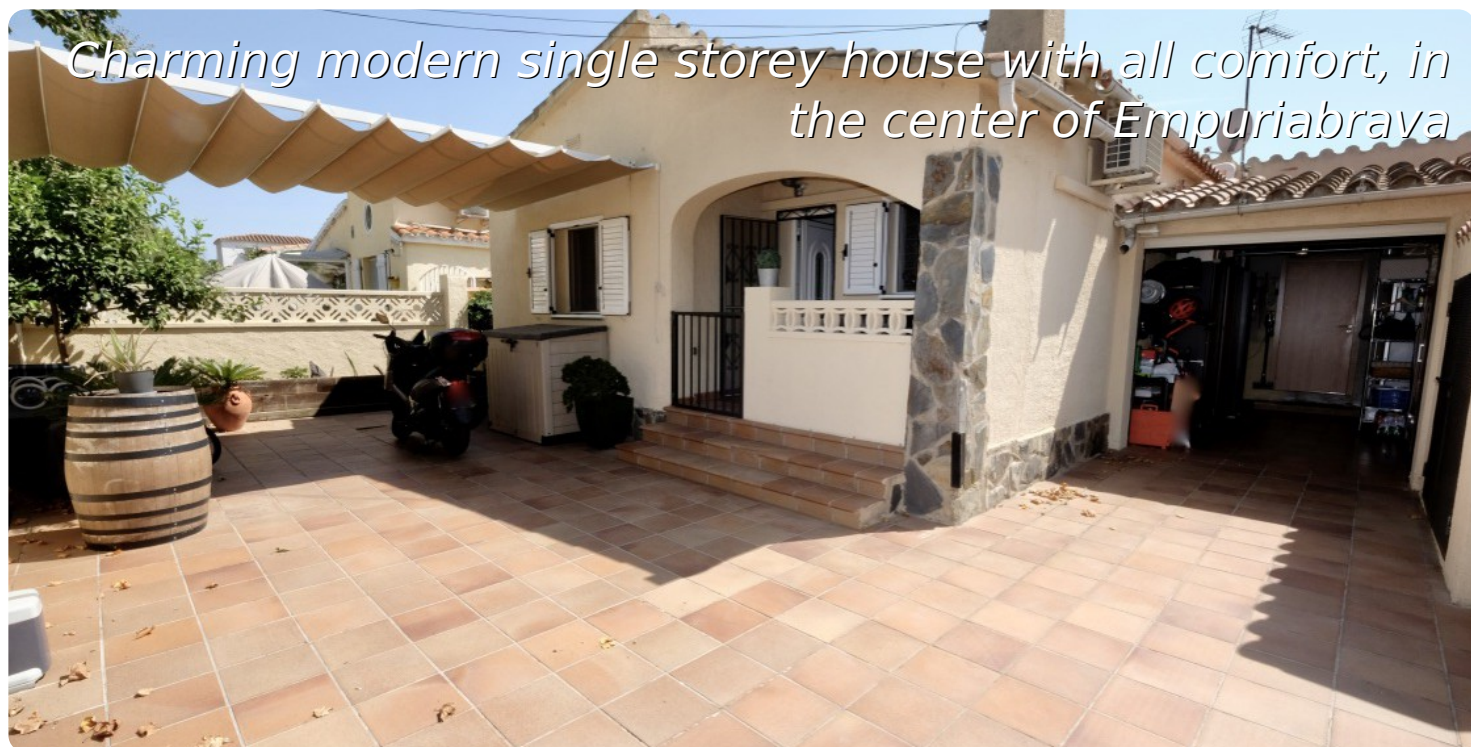
Charming modern single storey house with all comfort, in the center of Empuriabrava