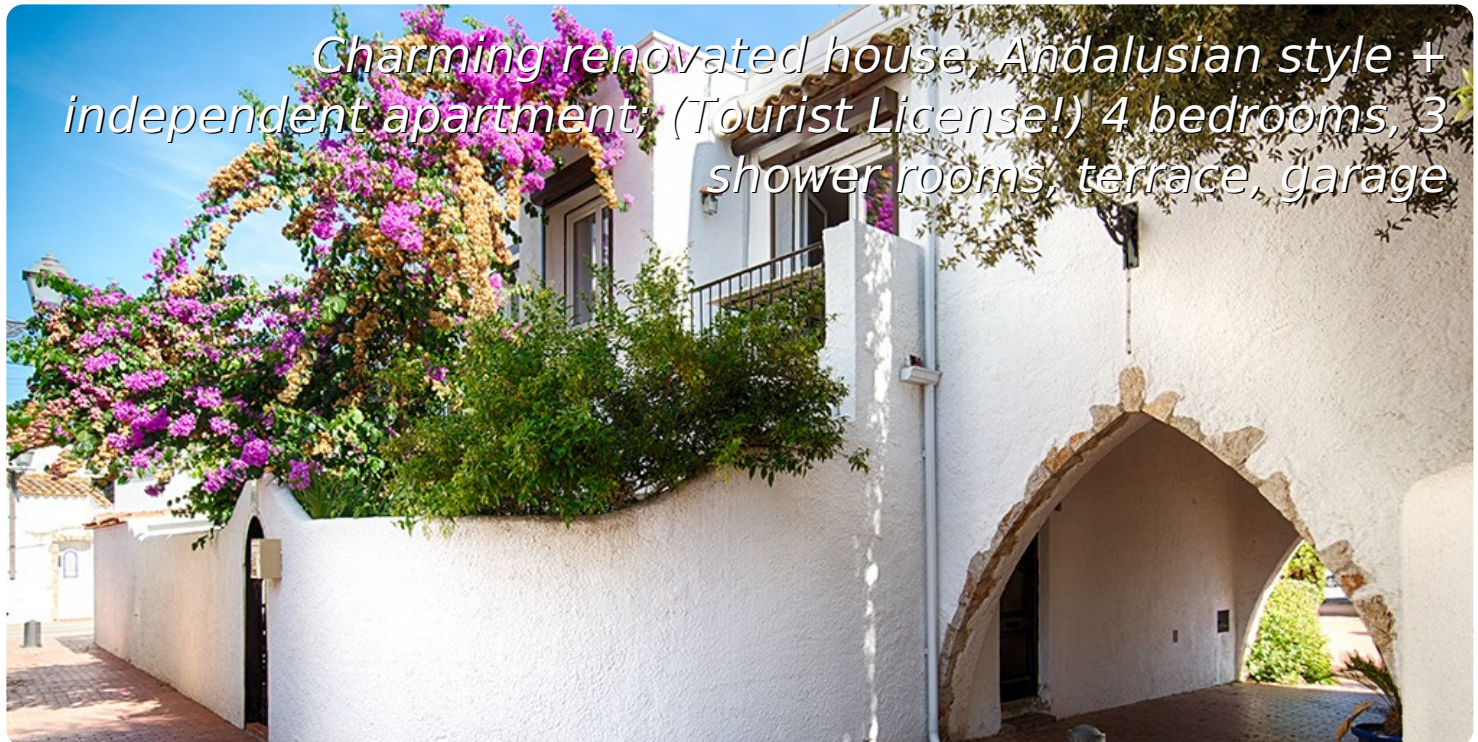
Charming renovated house, Andalusian style + independent apartment; (Tourist License!) 4 bedrooms, 3 shower rooms, terrace, garage